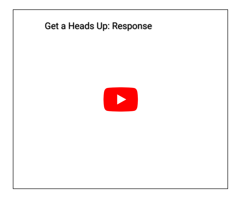
VIDEO: Heads Up Program on Responding to a Concussion.

Look for a program from an official organization, such as the CDC, that offers information on how to respond to a concussion as well as creating an action plan. Watch this video from the CDC: